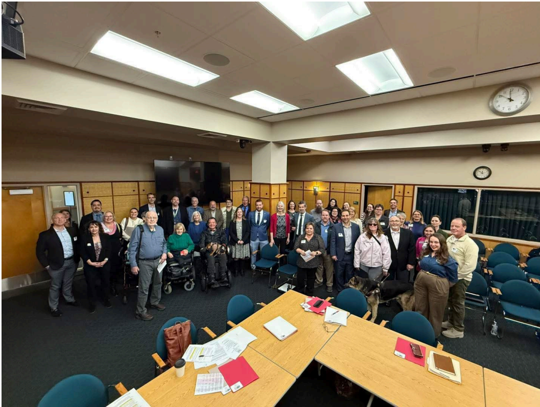
April 1 st , 2025: Transit Day at the Capital Members