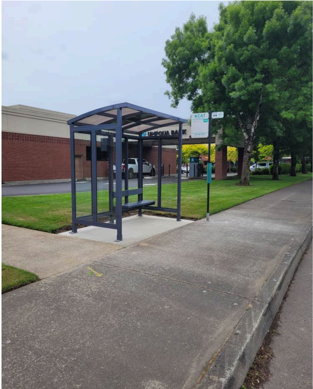
Bus Shelter at Highway 99E and Sequoia Parkway