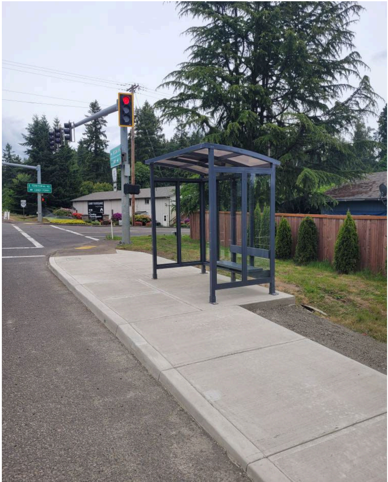
Bus Shelter at Highway 99E and Territorial Road (Northbound)