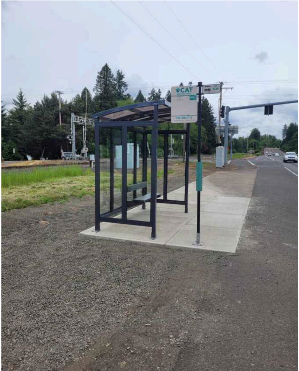
Bus Shelter at Highway 99E and Territorial Road (Southbound)