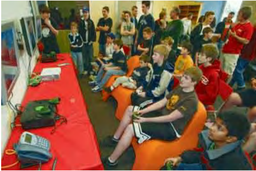
Teen zone and game room