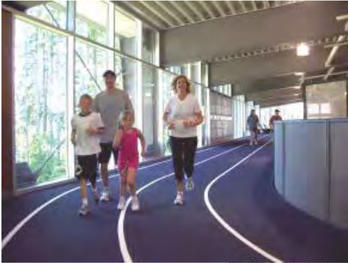
Track above gymnasium