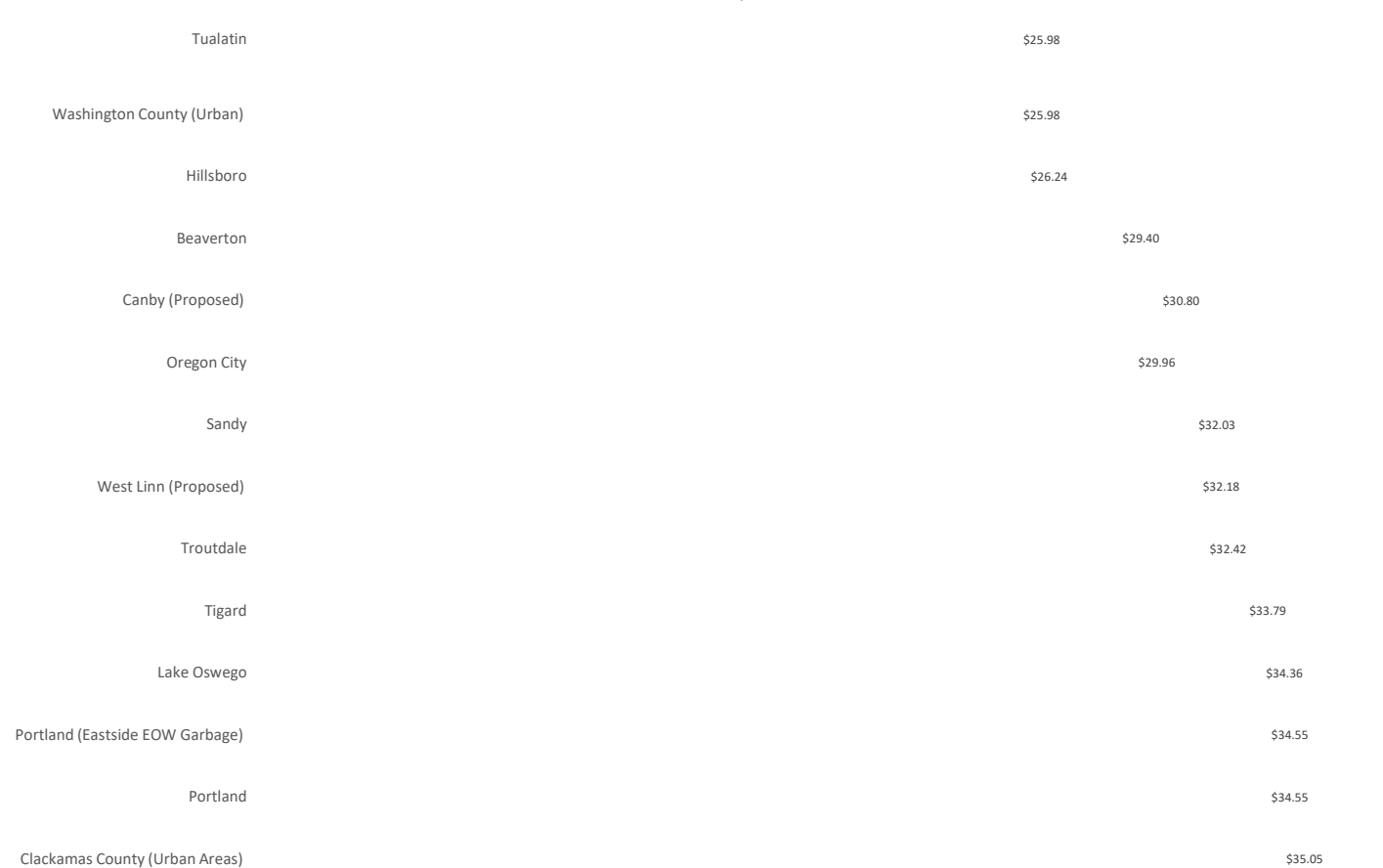
32/35 Gallon Cart Monthly Rates for Metro Area Communities