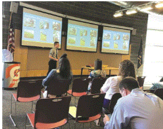
A presentation during the CHS Career & Technical Education summit.