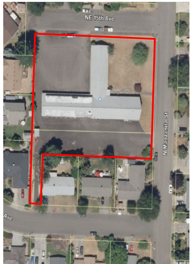
Figure 1. Site Aerial (site outlined in red)

According to ORS 227.175, this decision may be appealed to the Canby Planning Commission within ten (10) days of the date this notice was mailed. Request for an appeal must be in writing and be received by the Planning Department by 4:00 p.m. on April 10, 2023. Following an appeal, a Planning Commission hearing will be scheduled.