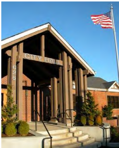
City Hall of Oregon City