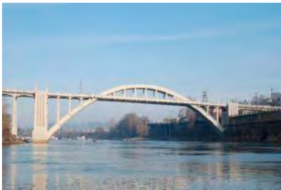
New Oregon City Arch Bridge