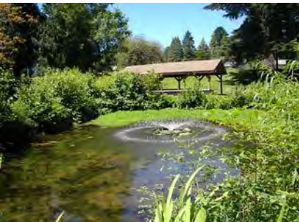
Willamette Park, West Linn, Oregon