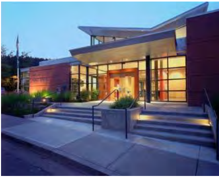
West Linn Library